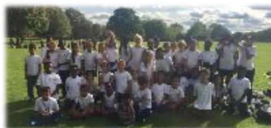
Table Tennis – October 2017