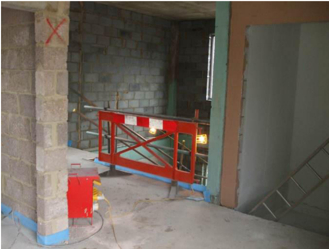
Photo 9 - North tower progress viewed from the roof access doors.