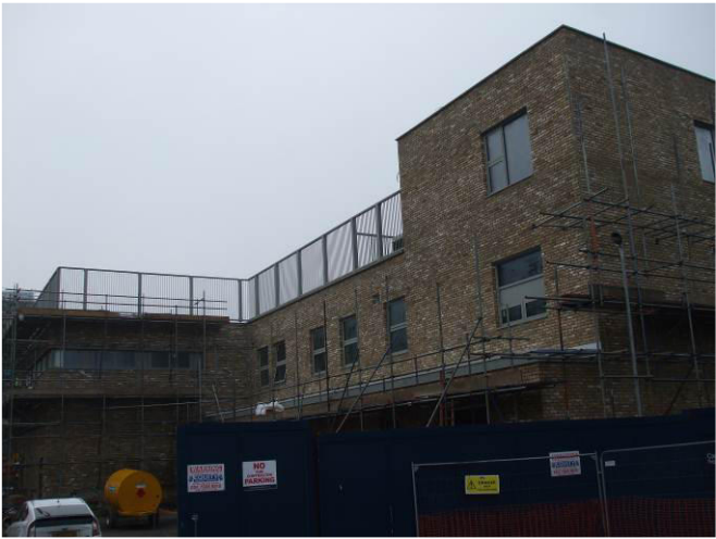
Photo 3 - Front elevation viewed from the north end of site.