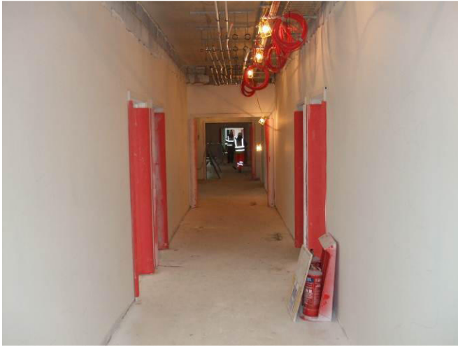
Photo 6 - First floor viewed from adjacent to the south end window.