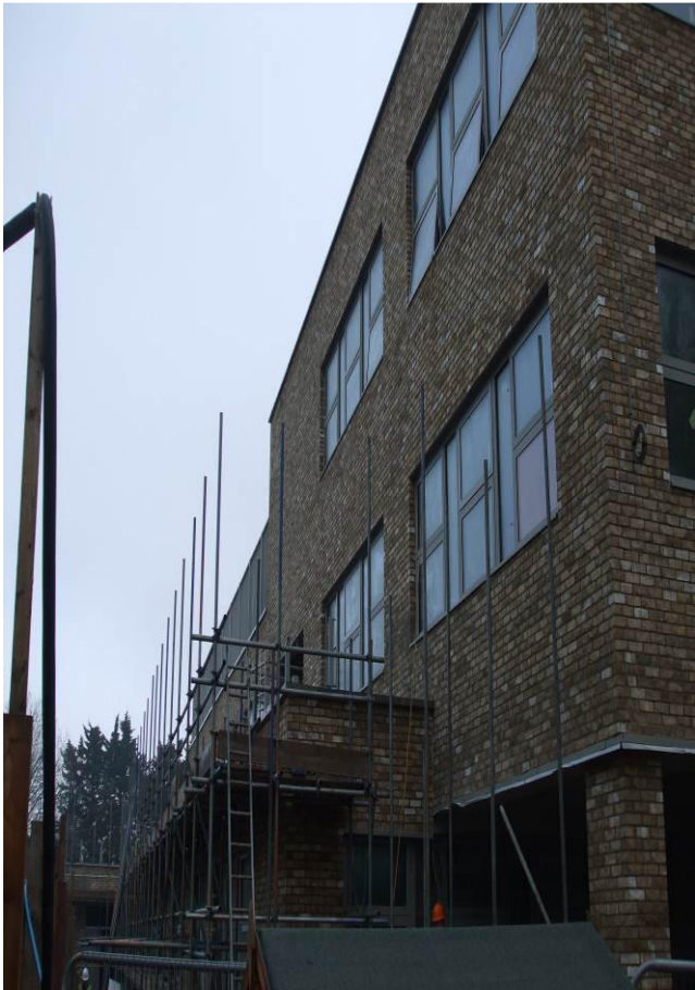
Photo 1 - Rear elevation viewed from Main Gate.