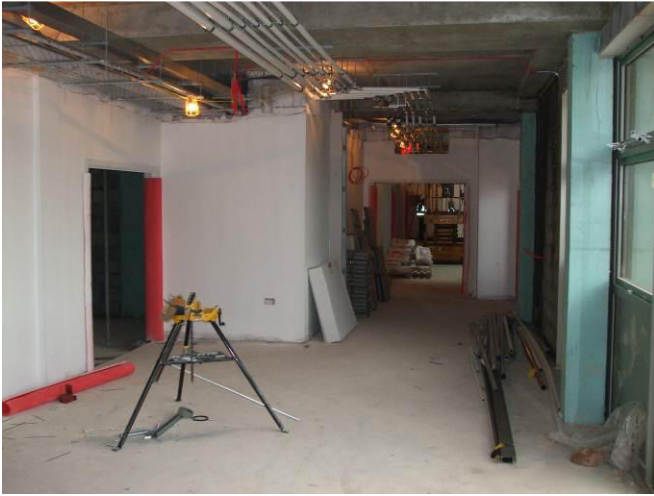
Photo 5 - Ground floor viewed from north adjacent to the WC.