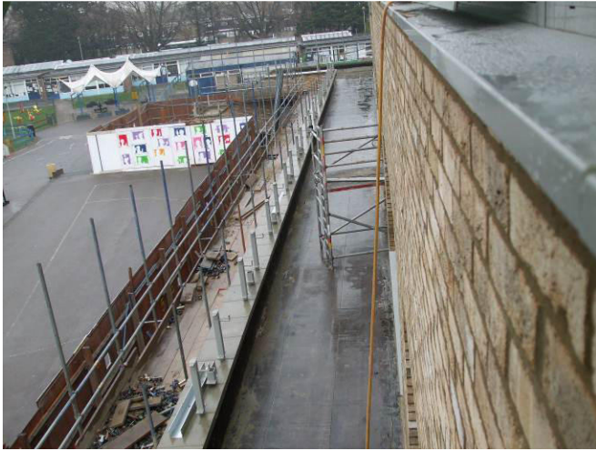
Photo 12 - Rear Balcony DHB viewed from a second floor window.