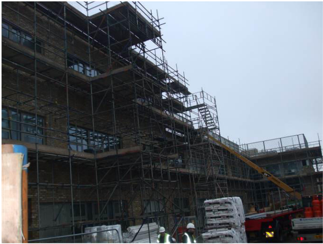
Photo 2 - Front elevation viewed from south end of side.