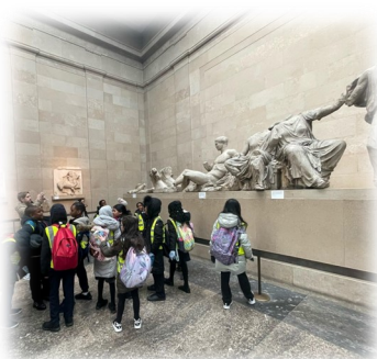
British Museum Visit