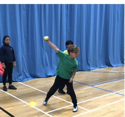
Sports In Your Future