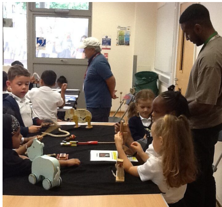
Year 1 History Workshop