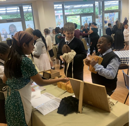
Year 6 History Workshop