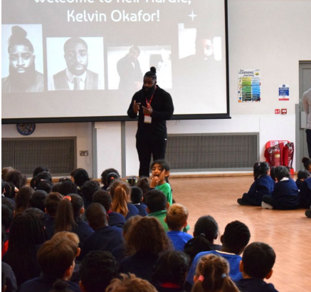
Special visit from Artist!