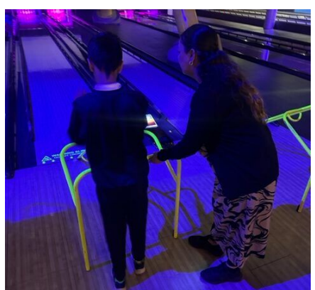
SEND Ten Pin Bowling