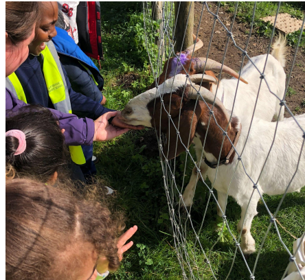
Year 2 visit to Lambourne End

Please click the links below to view some of the exciting learning that's been taking place!