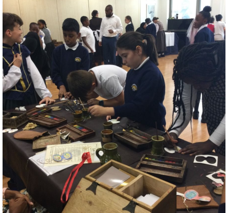
Year 5 History Workshop