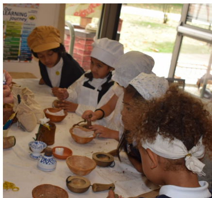
Year 2 History Workshop