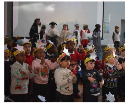
EYFS/Year 1 Nativity