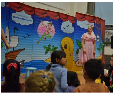
Family Pantomime Evening