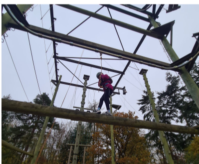
Fairplay House Residential