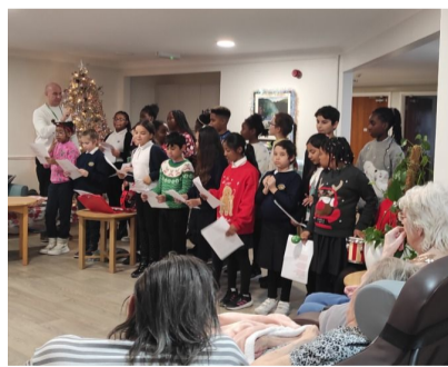
Choir Visit Summerdale Court Care Home