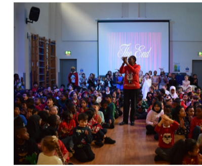
Year 2-6 Nativity