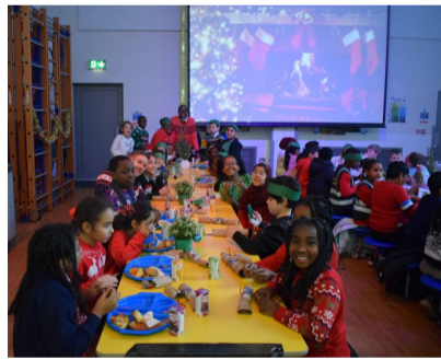
Christmas Lunch / Jumper Day