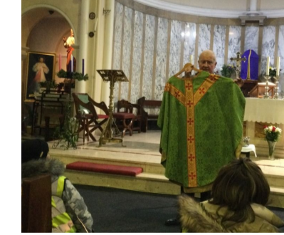
Reception Church Visit