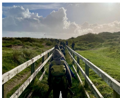
Year 6 Wales Residential

Please click the links below to view some of the exciting learning that's been taking place!