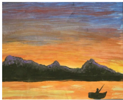
Arts Matters Online Exhibition